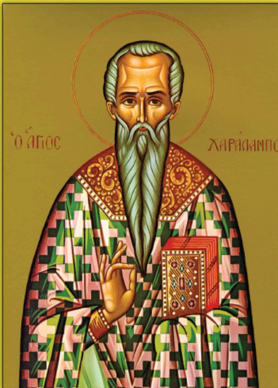
Icon of the Holy Priest-Martyr Charalampios -- February 10th