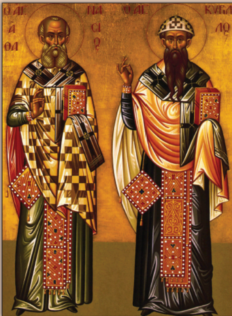
Icon of the Holy Fathers Athanasius and Cyril -- January 18th