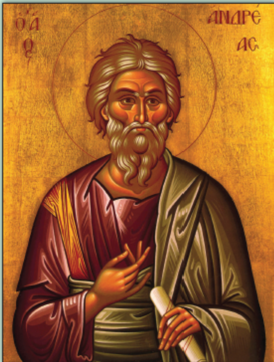
Icon of Saint Andrew -- November 30th