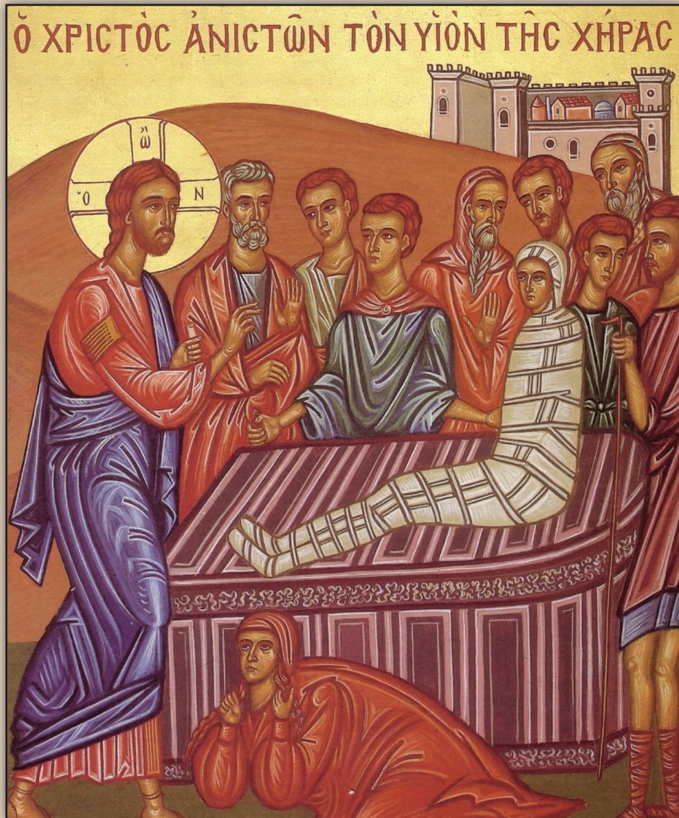
Icon of Christ Raising the Widow's Son