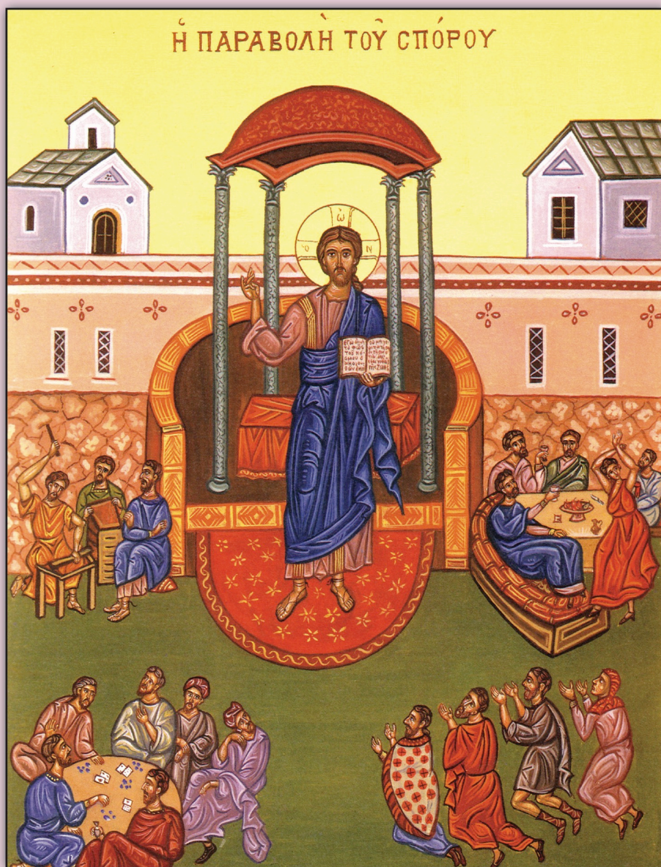
Icon of Parable of the Sower and Seed