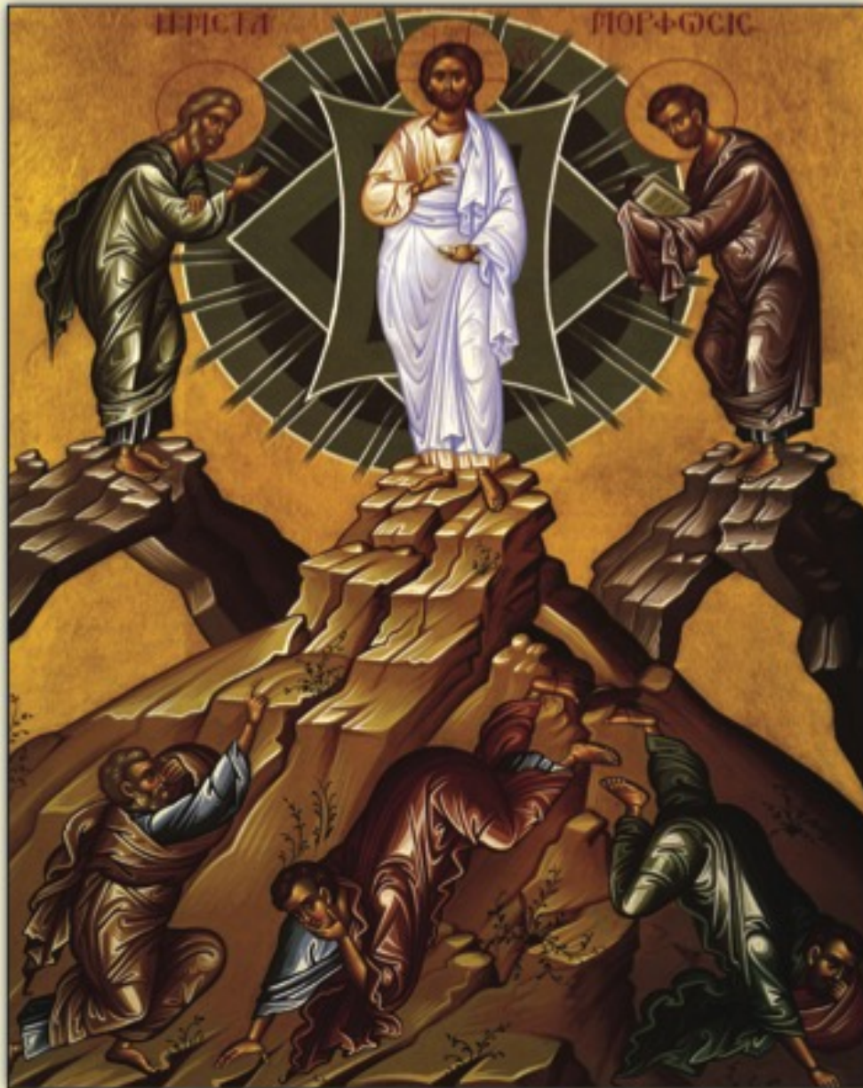
Icon of the Transfiguration of Our Lord