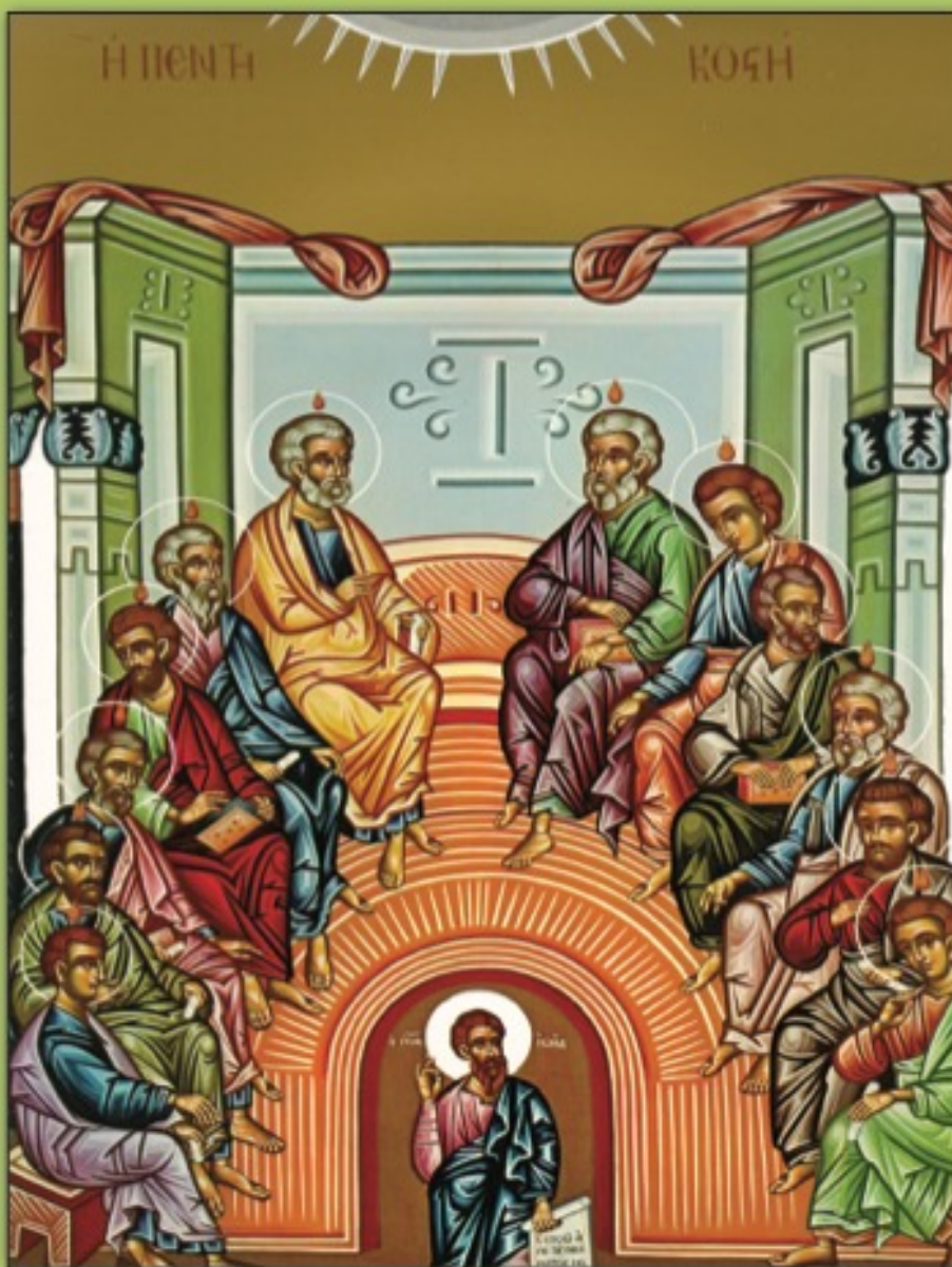
Icon of Pentecost, the Descent of the Holy Spirit