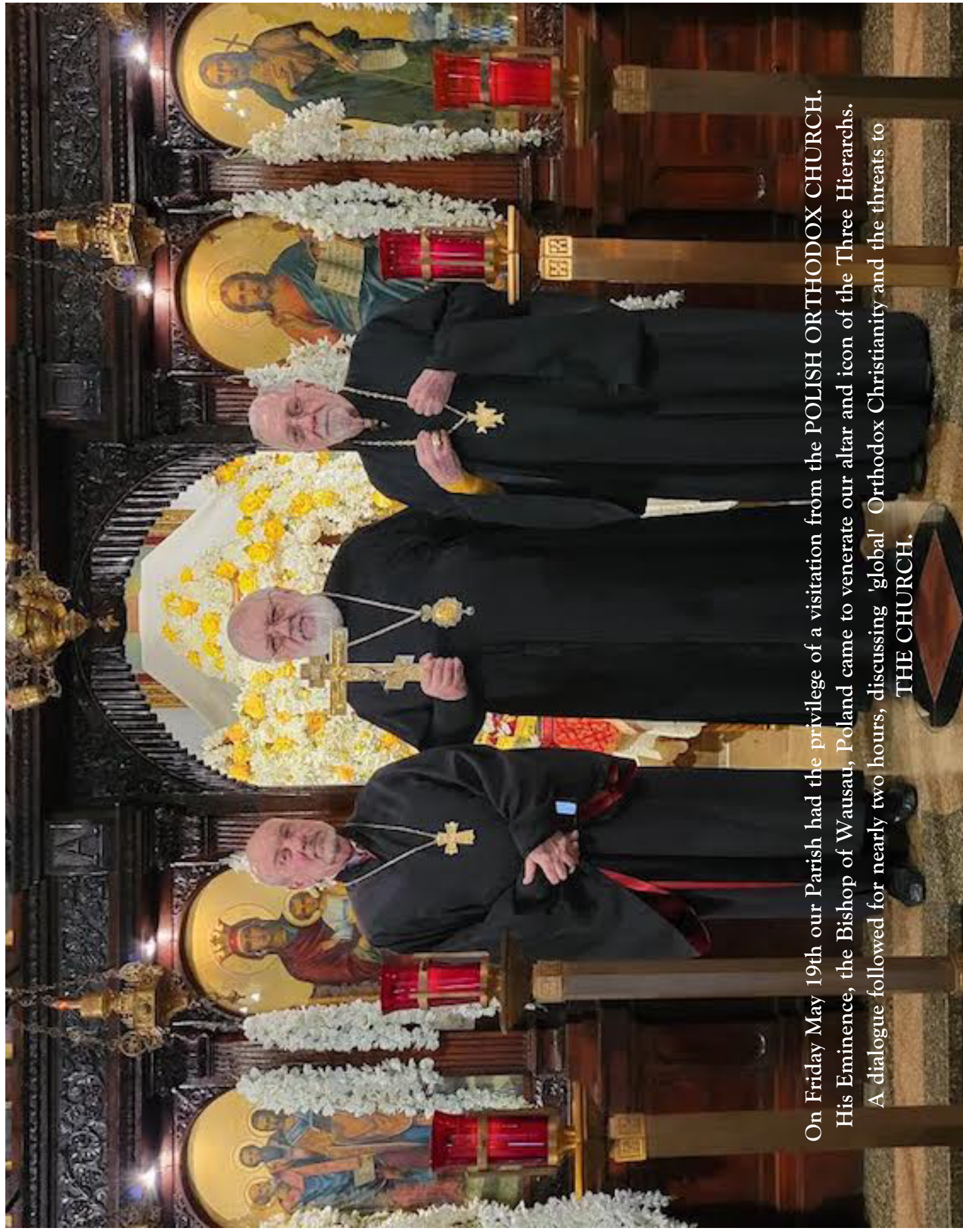
On Friday May 19th our Parish had the privilege of a visitation from the POLISH ORTHODOX CHURCH. His Eminence, the Bishop of Wausau, Poland came to venerate our altar and icon of the Three Hierarchs. A dialogue followed for nearly two hours, discussing 'global' Orthodox Christianity and the threats to THE CHURCH.