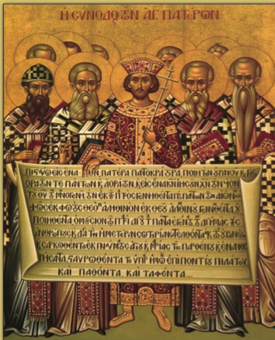
Icon of the Fathers of the First Ecumenical Council