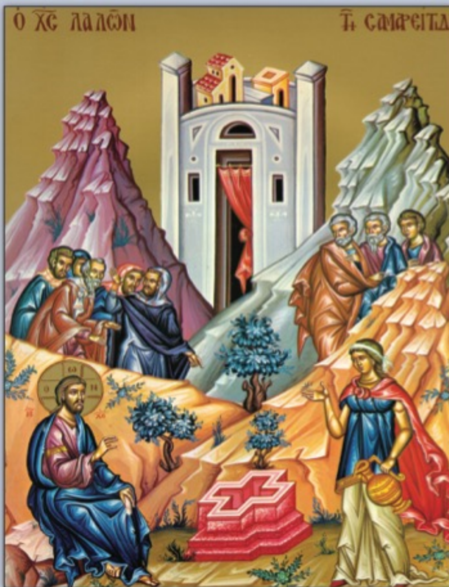
Icon of the Samaritan Woman