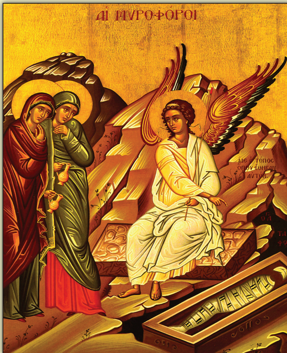
Icon of the Ointment-Bearing Women