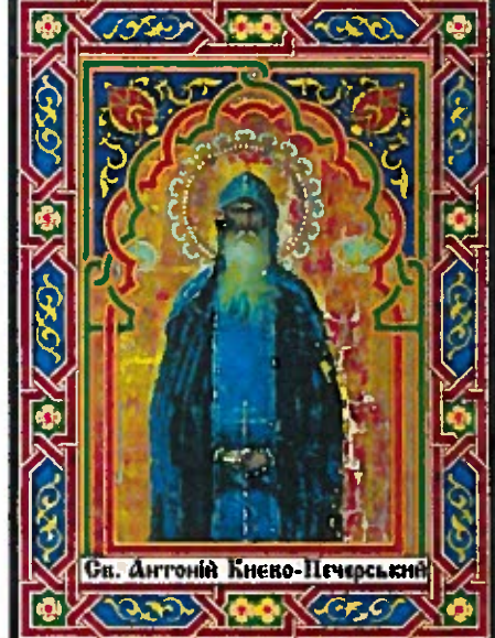
Св. Антоній Києво-Печерський