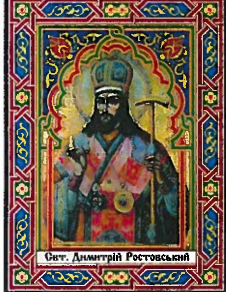
Свч. Дмитрій Ростовський