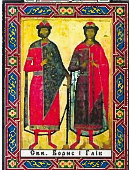
Свв. Борис і Гліб