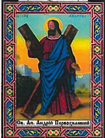
Св. Ап. Андрій Первозваний

St. Andrew Metropolia Center of the Ukrainian Orthodox Church of the USA South Bound Brook, NJ