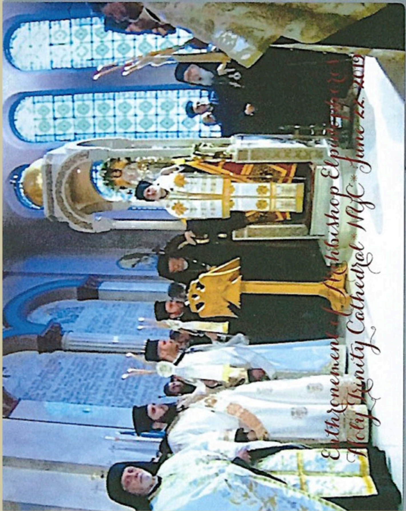
Enthronement of Archbishop Epiphanius (I) Holy Trinity Cathedral * M.C. * June 22, 2019