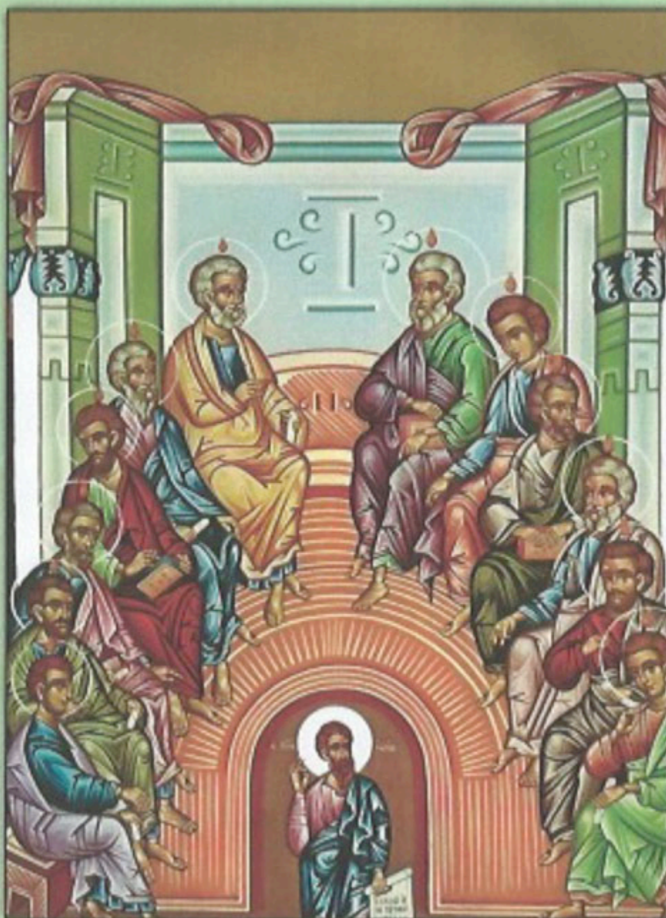
Icon of Pentecost