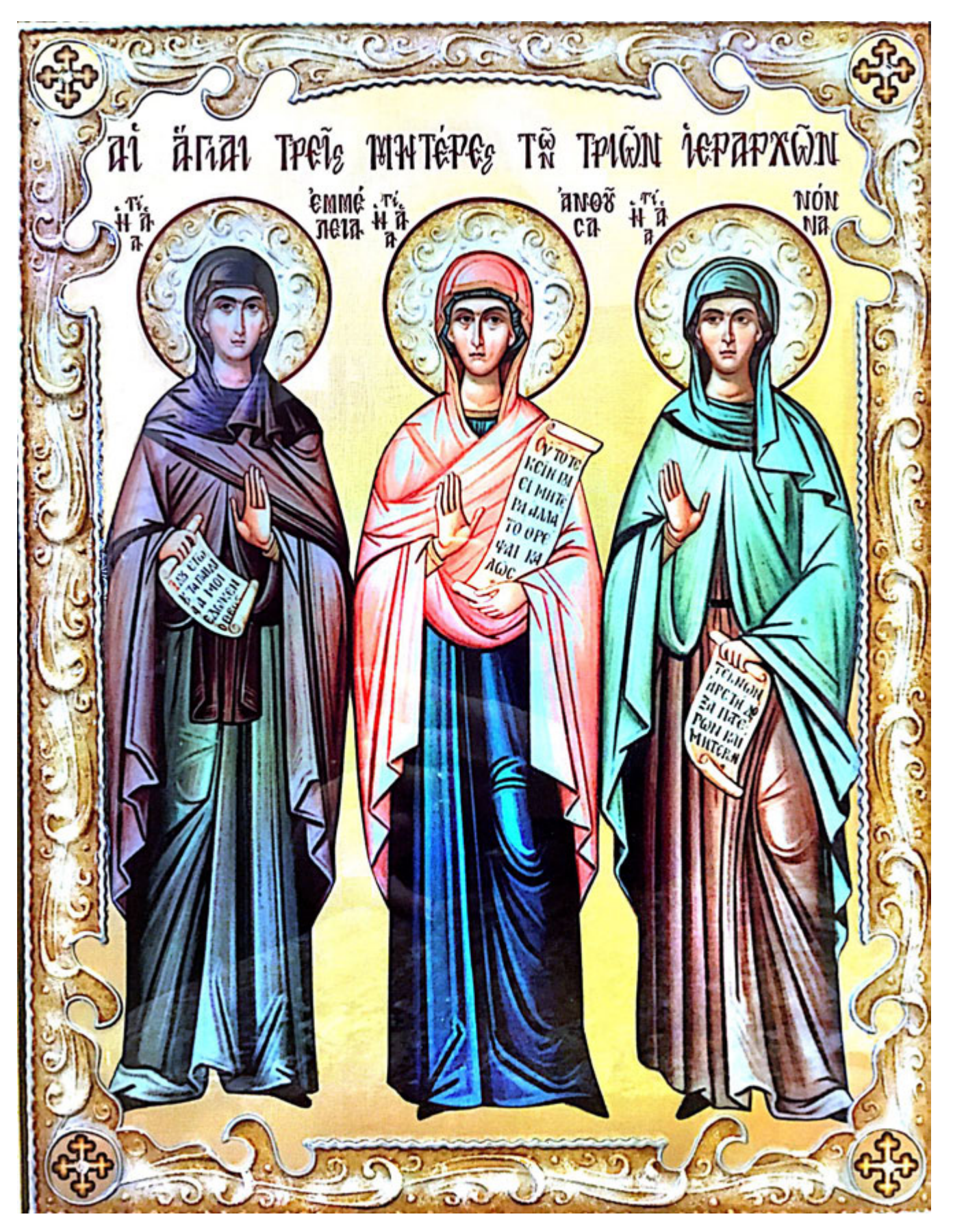
The Three Holy Mothers of the Three Hierarchs Saint Emmeleia Saint Anthousa Saint Nonna