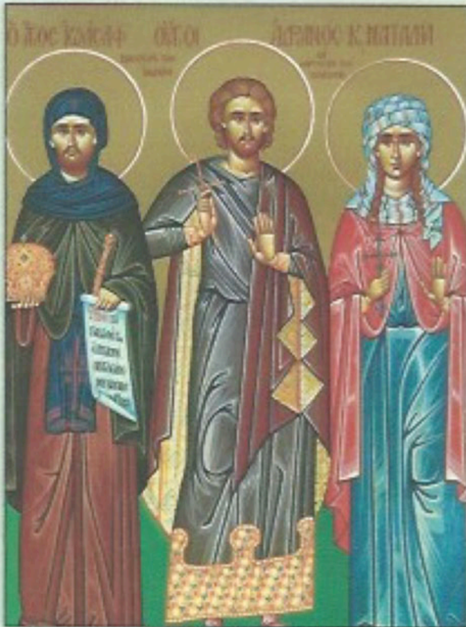
Icon of Saints Adrian, Natalie and Joseph — August 26th

1724 Avenue P Brooklyn, New York 11229-1206 Tel: (718) – 339- 0280 Web site: www.threehierarchsbrooklynny.org E-mail : info@threehierarchsbrooklyn.org