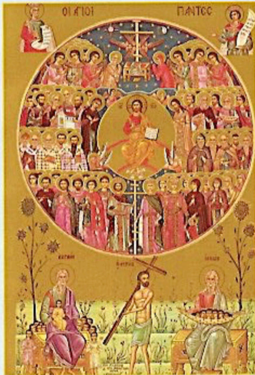
Icon of All Saints