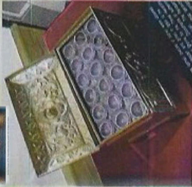
The Relics are located in the narthex of the St. Photios Chapel

Today, the reliquary is encased in the chapel narthex. The public can venerate the remains of the following Saints: Peter, Paul, Titus of Crete, Helena, Constantine, Savvas, Anthony, John Chrysostom, Basil, Gregory of Nazianzas, Gregory of Nyssa, Cyril of Alexandria, Cyril of Jerusalem, Nicholas of Myra, Ambrosios, Haralambos and John of Damascus.