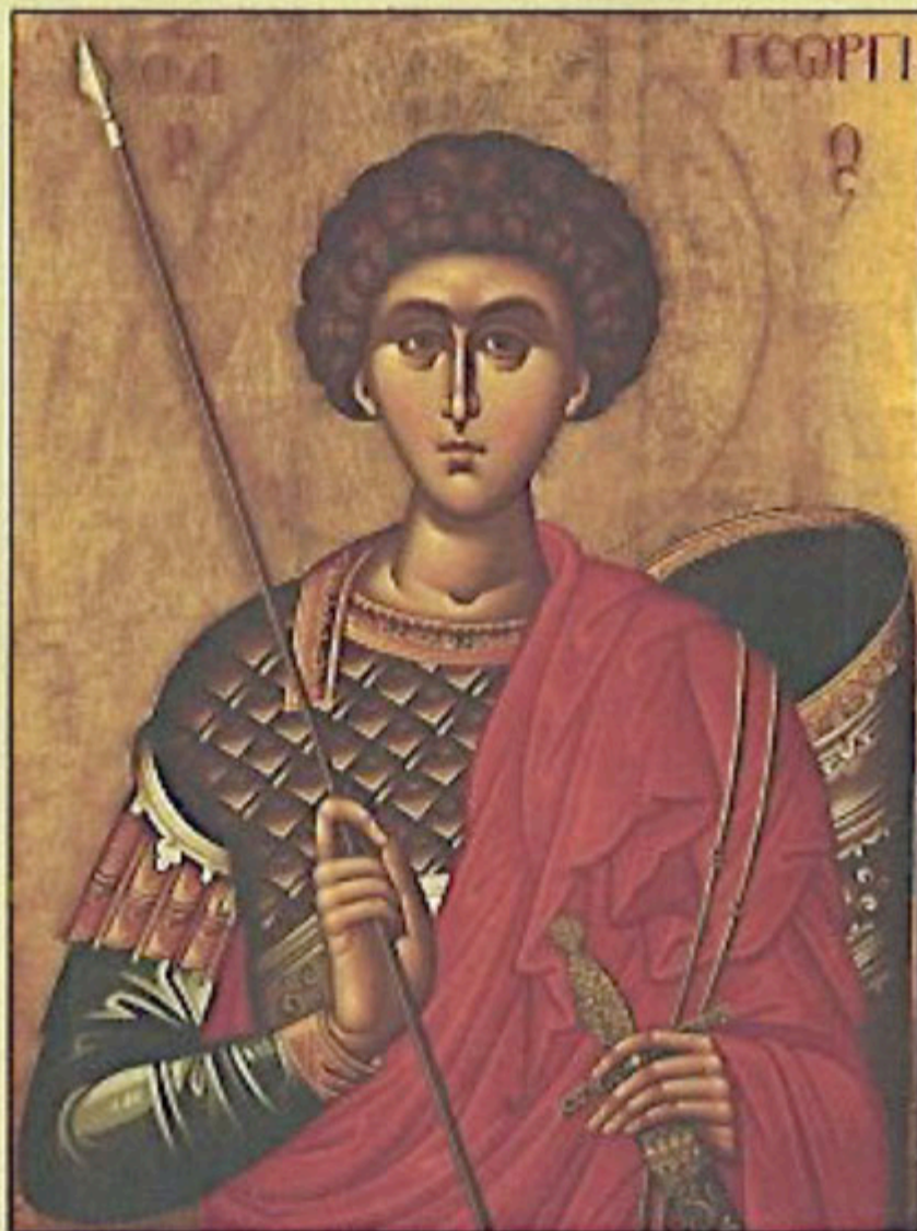
Icon of Saint George -- April 23rd