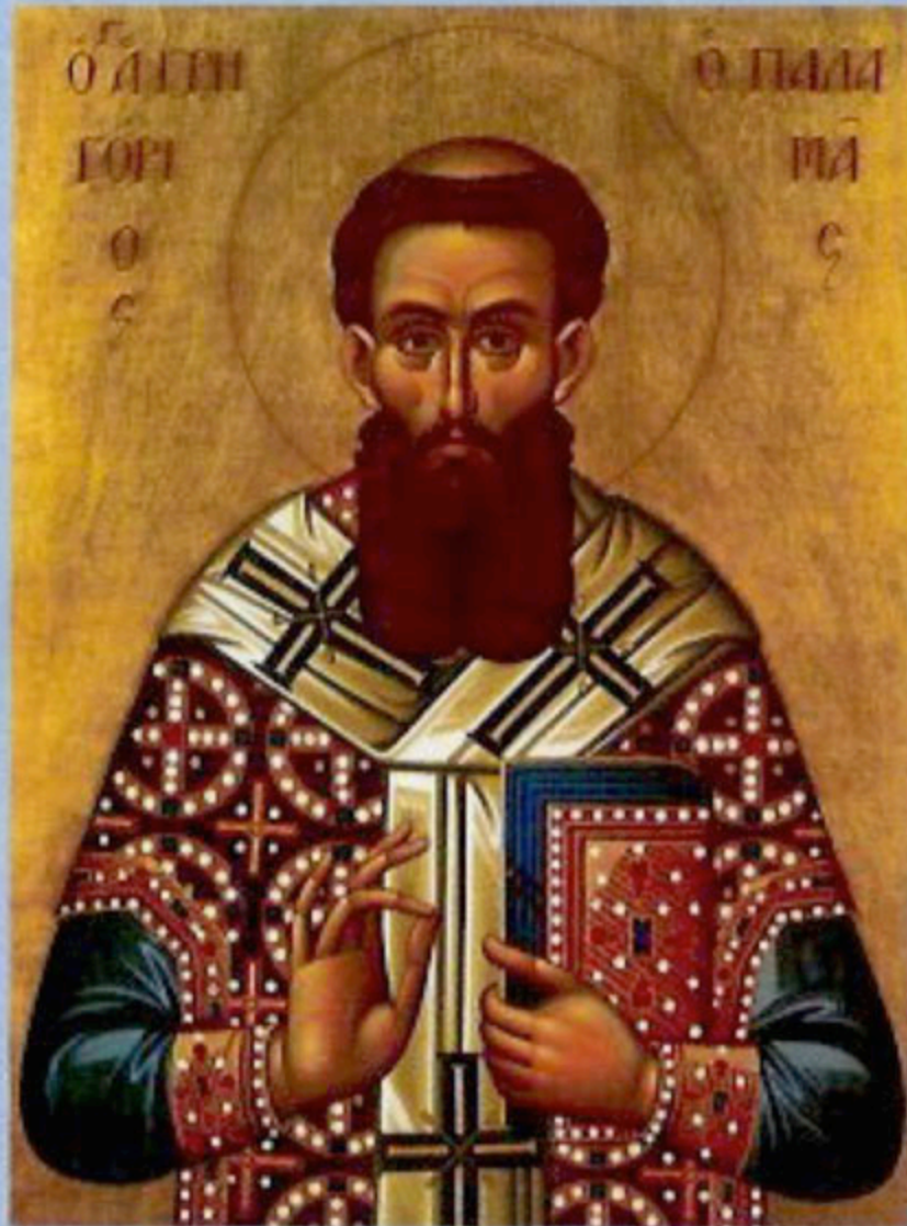
Icon of Saint Gregory Palamas

SECOND SUNDAY OF THE GREAT FAST SUNDAY OF SAINT GREGORY PALAMAS