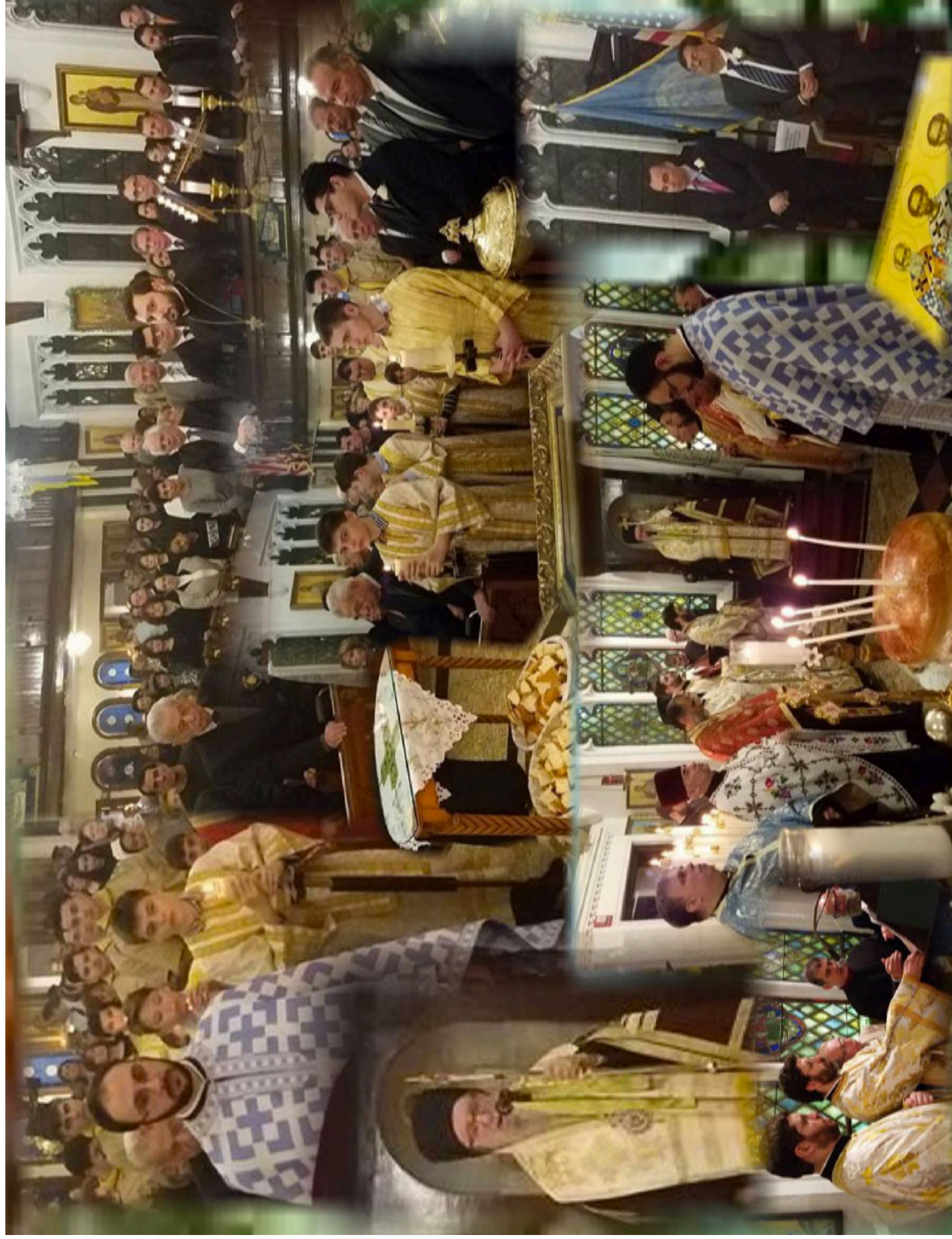
The week-end of January 29-30th, filled the church with services and festivities honoring the Patrons of the Parish - THE THREE HOLY HIERARCHS (Saints Gregory the Theologian, Basil the Great and John the Chrysostom). With liturgies, vespers, receptions, programs, citations, presentations, benevolence and other events the celebration was a major success.