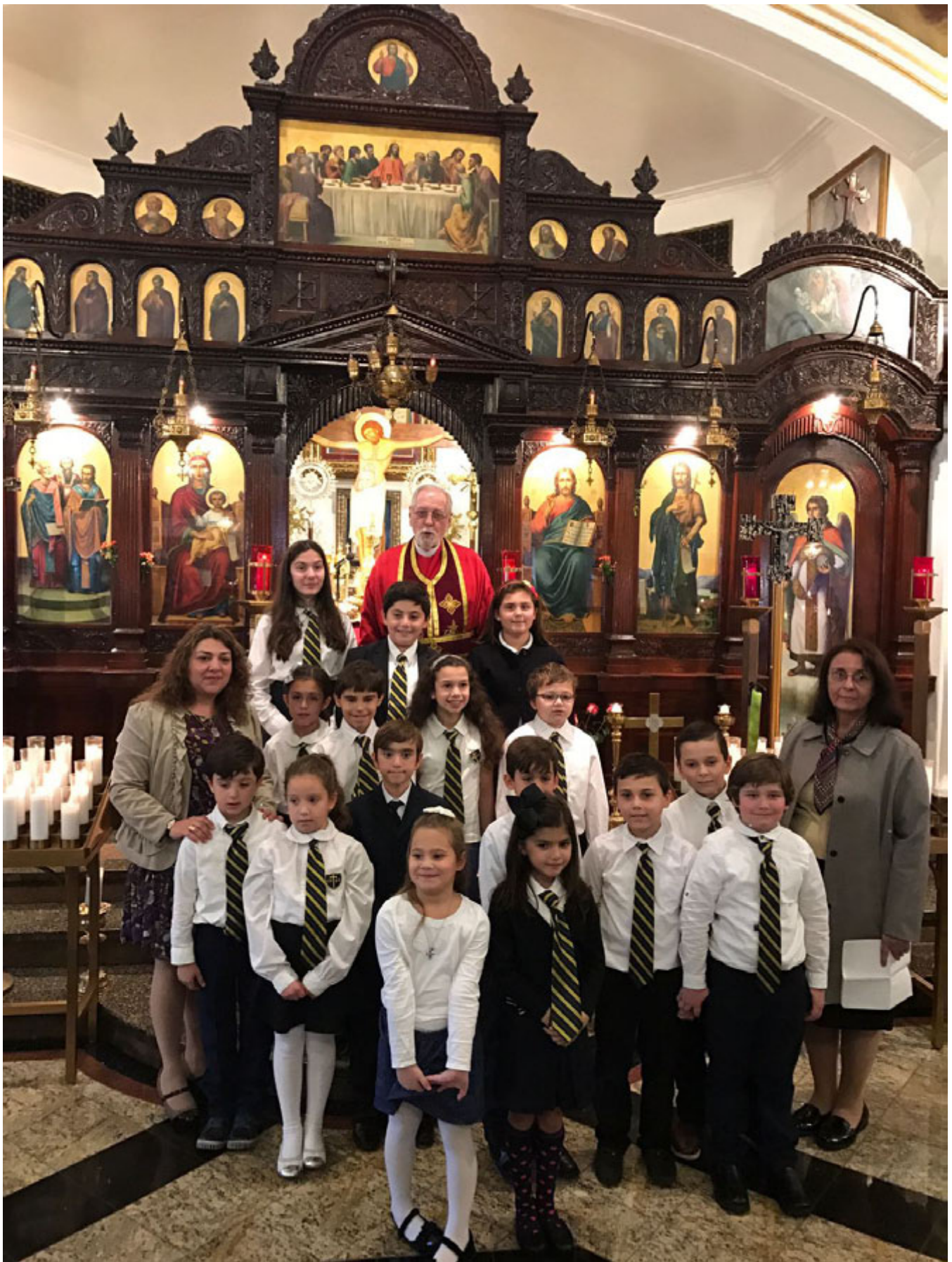
GREEK SCHOOL CHILDREN of the parish observe the occasion of 'OXI' DAY with an ethnic cultural presentation in Church last Sunday. Blessed be the parents who nurture the HELLENIC education of their children! ZHTO H ELLADA! ZHTO TO KRATOS! ZHTO H AMERIKI!