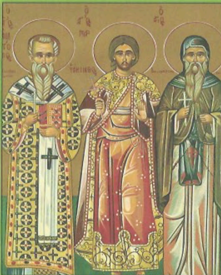
Icon of Saints Anatolius and Others — July 3rd

1724 Avenue P Brooklyn, New York 11229-1206 Tel: (718) – 339- 0280 Web site: www.threehierarchsbrooklynny.org E-mail : info@threehierarchsbrooklyn.org