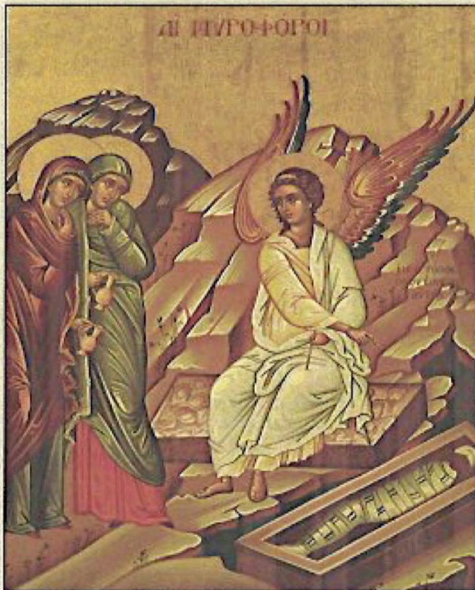
Icon of the Myrrh-Bearing Women