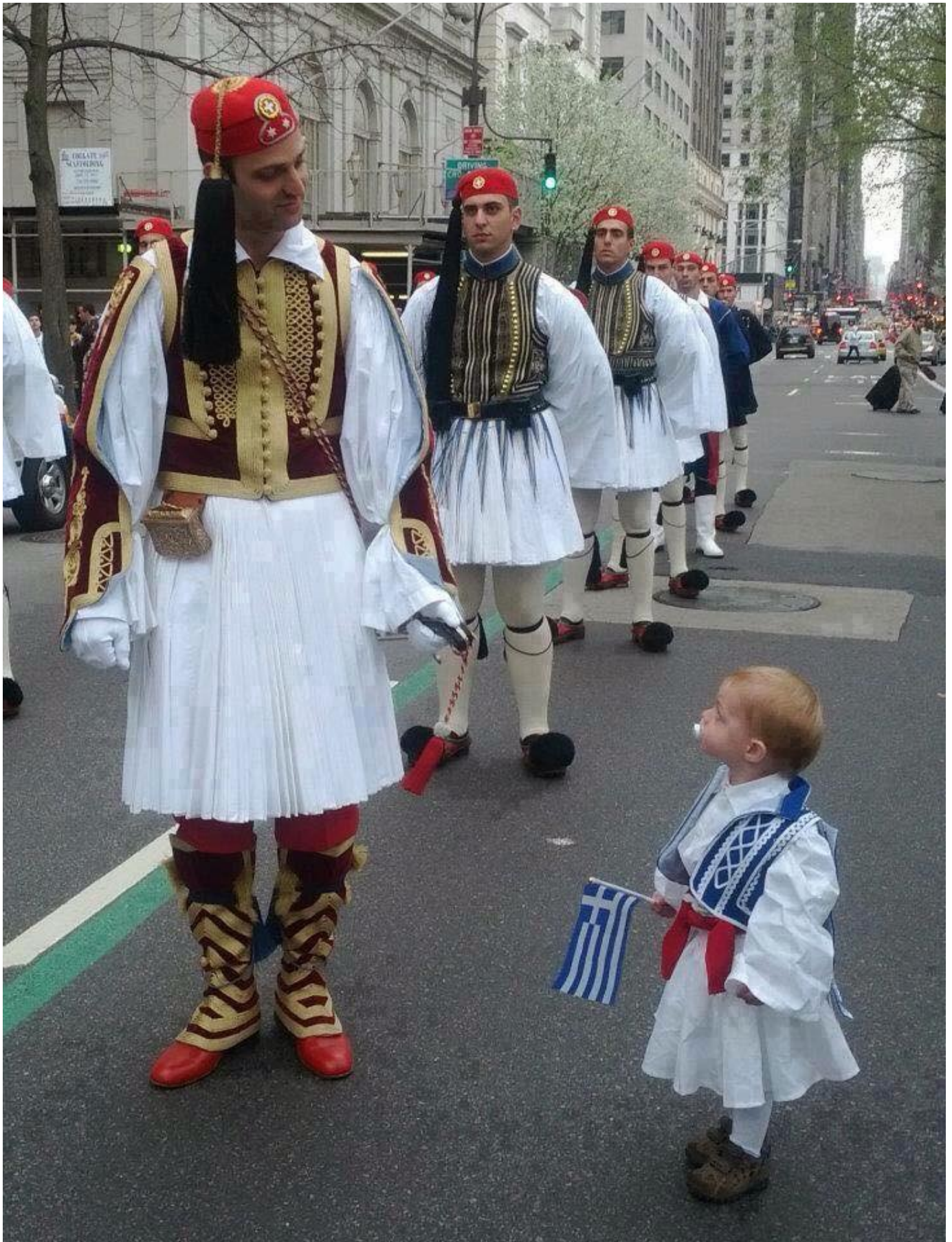
EVZONES ARE THE ELITE GUARD FOR THE GREEK PARLIAMENT. AS WE CAN SEE THEY COME IN ALL SIZES! EVZONES WILL PARADE ON FIFTH AVENUE TODAY!