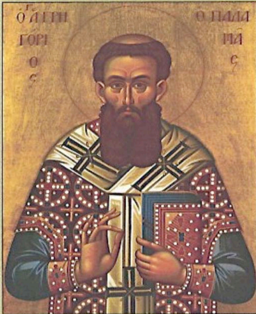
Icon of Saint Gregory Palamas

SECOND SUNDAY OF THE GREAT FAST SUNDAY OF SAINT GREGORY PALAMAS