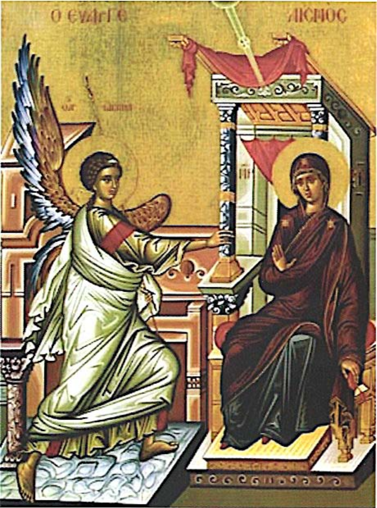
The Feast of the Annunciation of Our Most Holy Lady, the Theotokos and Ever – Virgin Mary is celebrated on March 25th each year. The Feast commemorates the announcement by the Archangel Gabriel to the Virgin Mary that our Lord and Savior Jesus Christ, the Son of God, would become incarnate and enter into this world through her womb.