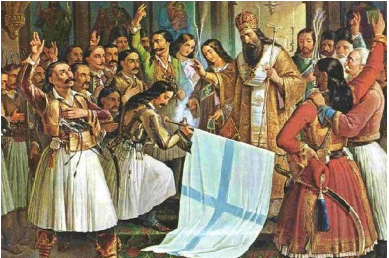
1821 ~ Greek Independence ~2016