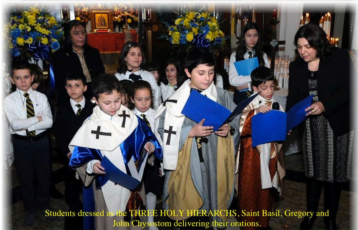
Students dressed as the THREE HOLY HIERARCHS, Saint Basil, Gregory and John Chysostom delivering their orations.