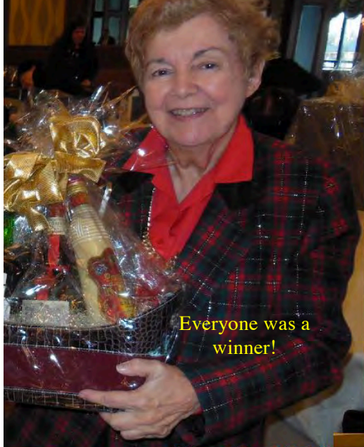
Everyone was a winner!