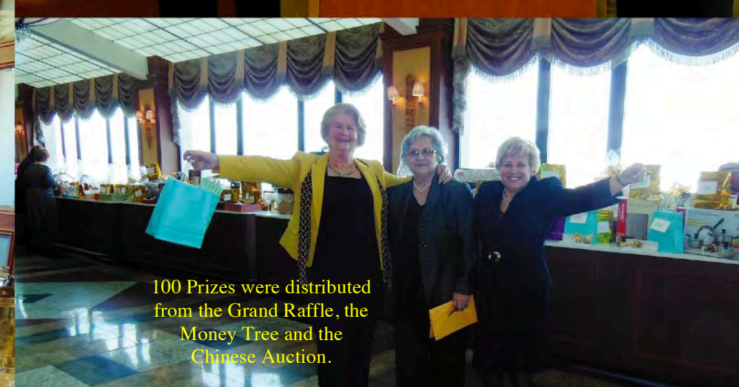
100 Prizes were distributed from the Grand Raffle, the Money Tree and the Chinese Auction.