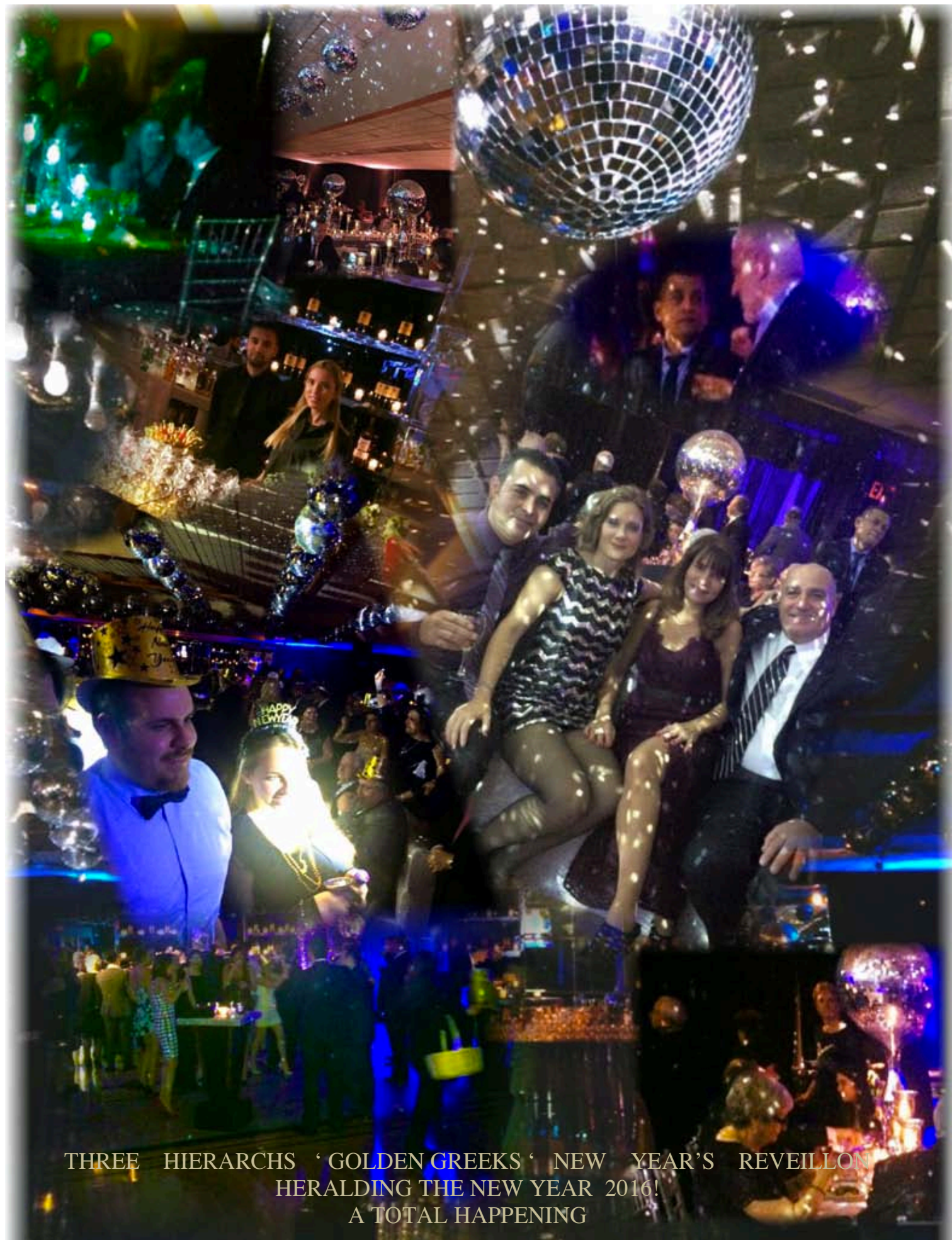
THREE HIERARCHS 'GOLDEN GREEKS' NEW YEAR'S REVEILLON HERALDING THE NEW YEAR 2016! A TOTAL HAPPENING